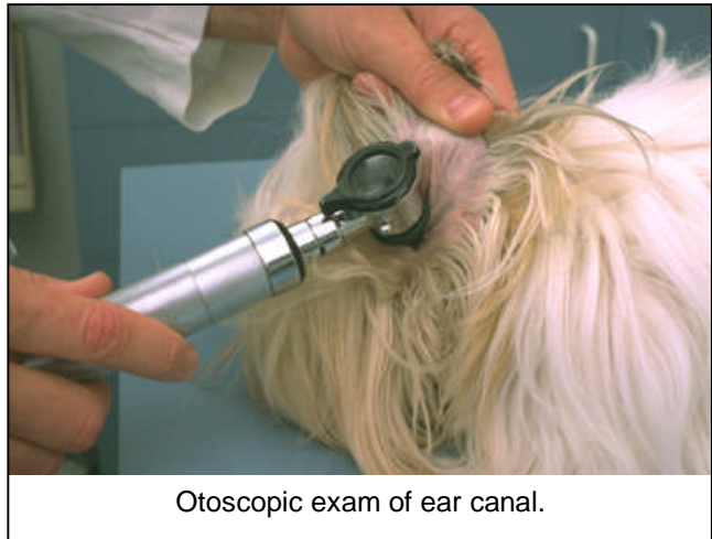
Otosopic exam of ear canal.

An important part of the evaluation of the patient is the identification of underlying disease. Many dogs with chronic or recurrent ear infections have allergies or low thyroid function (hypothyroidism). If underlying disease is suspected, it must be diagnosed and treated or the pet will continue to experience chronic ear problems.